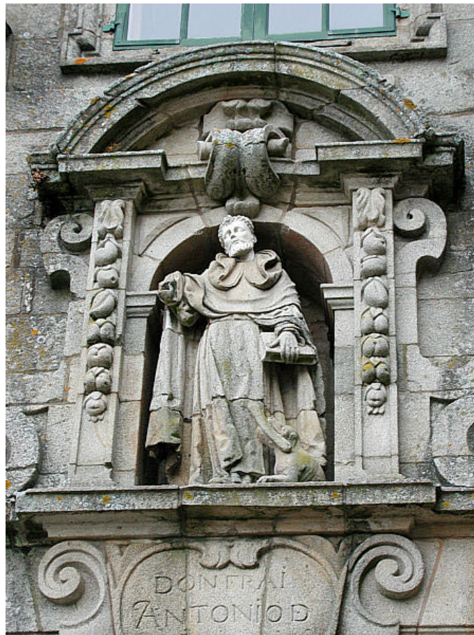
Sculpture in Santiago de Compostela, Spain

Dominic founded the Order of Preachers (the "Dominicans") initially to preach against Albigensianism in Southern France and Italy. From there the order spread widely, especially in Spain, where it emphasized preaching to Muslims in the newly conquered territories. From Spain it also spread to the Americas, again emphasizing preaching and conversion.