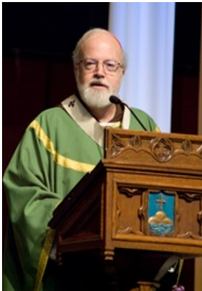
Cardinal Seán Patrick O'Malley, OFM Cap., Archbishop

The Archdiocese of Boston also was blessed to have the Pilgrimage of Hope since the Archdiocese is celebrating its 200 th anniversary. Cardinal O'Malley said he hoped this celebration of Mary would aid the Archdiocese in healing and making reparation, and in honoring our Mother. Finally, the Archdiocese felt motivated to promote the anniversary of Magnificat Magazine – 10 years!