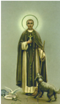
St. Martin de Porres Nov 3

For the last few years the Lay Dominican structure has tried to emphasize our obligation to the Apostolate. Many, many of you have responded magnificently in so many ways. Thank you! Others have responded a little, shall I say, grudgingly or really not at all. This is an essential part of the Lay Dominican charism and one that you freely promised to incorporate into your life. You can fudge your Dominican obligation to the apostolate and maybe no one will ever call you on it. But this will not relieve you of the obligation placed upon all Christians by this Gospel. You cannot fool the King and on that day when